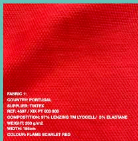
FABRIC 1: COUNTRY: PORTUGAL SUPPLIER: TITEX REF: 489 / XX PT 003 908 COMPOSITION: 97% LENZING™ LYOCEL / 3% ELASTANE WEIGHT: 200 g/m 2 WIDTH: 195cm COLOUR: FLAME SCARLET RED