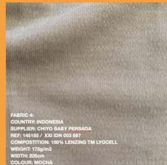
FABRIC 4: COUNTRY: INDONESIA SUPPLIER: CHIYO BABY PERSADA REF: 145155 / XXI IDN 903 907 COMPOSITION: 100% LENZING TM LYOCELL WEIGHT: 175g/m 2 WIDTH: 205cm COLOUR: MOCHA