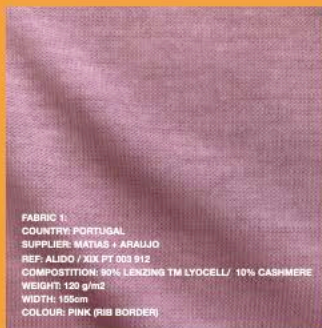
FABRIC 1: COUNTRY: PORTUGAL SUPPLIER: MATIAS + ARALJO REF: ALIDO / XXI PT 003 912 COMPOSITION: 90% LENZING TM LYOCELL / 10% CASHMERE WEIGHT: 120 g/m 2 WIDTH: 195cm COLOUR: PINK (RIB BORDER)