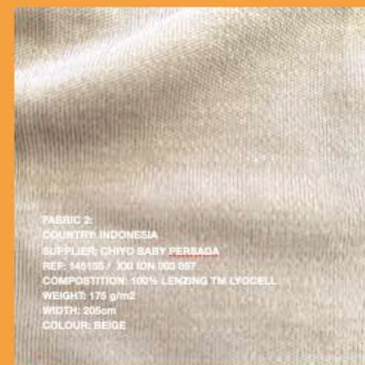
FABRIC 2: COUNTRY: INDONESIA SUPPLIER: CHIYO BABY PERSADA REF: 140195 / XXI IDN 903 907 COMPOSITION: 100% LENZING TM LYOCELL WEIGHT: 175 g/m 2 WIDTH: 205cm COLOUR: BEIGE