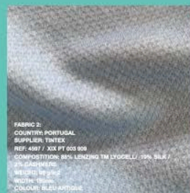
FABRIC 2: COUNTRY: PORTUGAL SUPPLIER: TITEX REF: 489 / XX PT 003 909 COMPOSITION: 85% LENZING™ LYOCEL / 15% SILK / 3% ELASTANE WEIGHT: 210 g/m 2 WIDTH: 195cm COLOUR: BLEU ARTISAN