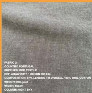
FABRIC 3: COUNTRY: PORTUGAL SUPPLIER: RSD TEXTILE REF: ATANK18017 / XXI IDN 903 914 COMPOSITION: 87% LENZING TM LYOCELL / 33% ORG. COTTON WEIGHT: 200 g/m 2 WIDTH: 155cm COLOUR: NIGHT SKY